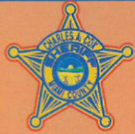
Miami County Sheriff's Office