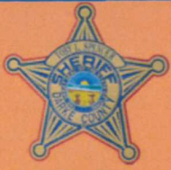
Darke County Sheriff's Office