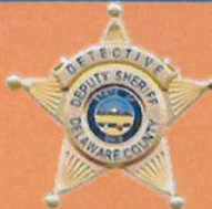
Delaware County Sheriff's Office