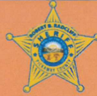
Pickaway County Sheriff's Office