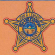
Shelby County Sheriff's Office