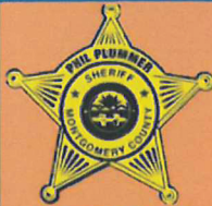
Montgomery County Sheriff's Office