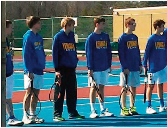
Above: The team prepares to meet their opponents.